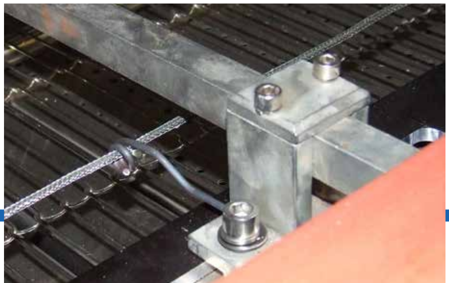
■ Figure 4. Close up of a typical probe.