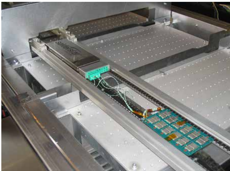
■ Figure 1. A profiler with four thermocouples attached to crucial components.

The main problem with this method is keeping the test board in good working order. The thermocouple sensors used to establish the profile during the initial set-up stage needs to respond quickly to temperature change and not influence the measurement. The result of this is that they are inherently fragile and need to be frequently replaced which is both time consuming and can result in measure-