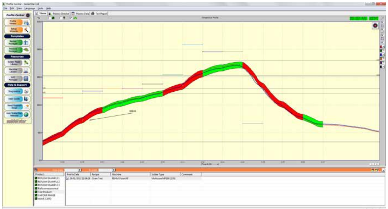
■ Figure 3. The oven verification tool accurately charts the reflow profile.