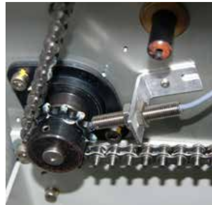
■ Figure 5. Close up of the speed sensor monitoring the conveyor speed.

All these benefits have improved manufacture and saved in time and money as it is a permanent and immediate method of profiling. Because of these obvious advantages manufacturers of military, automotive and medical devices are moving towards this technology as their preferred method of profiling as it is consistent, accurate and provides 100%